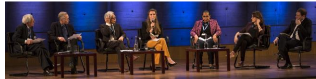
YESS represented in IPCC high-level panel discussion